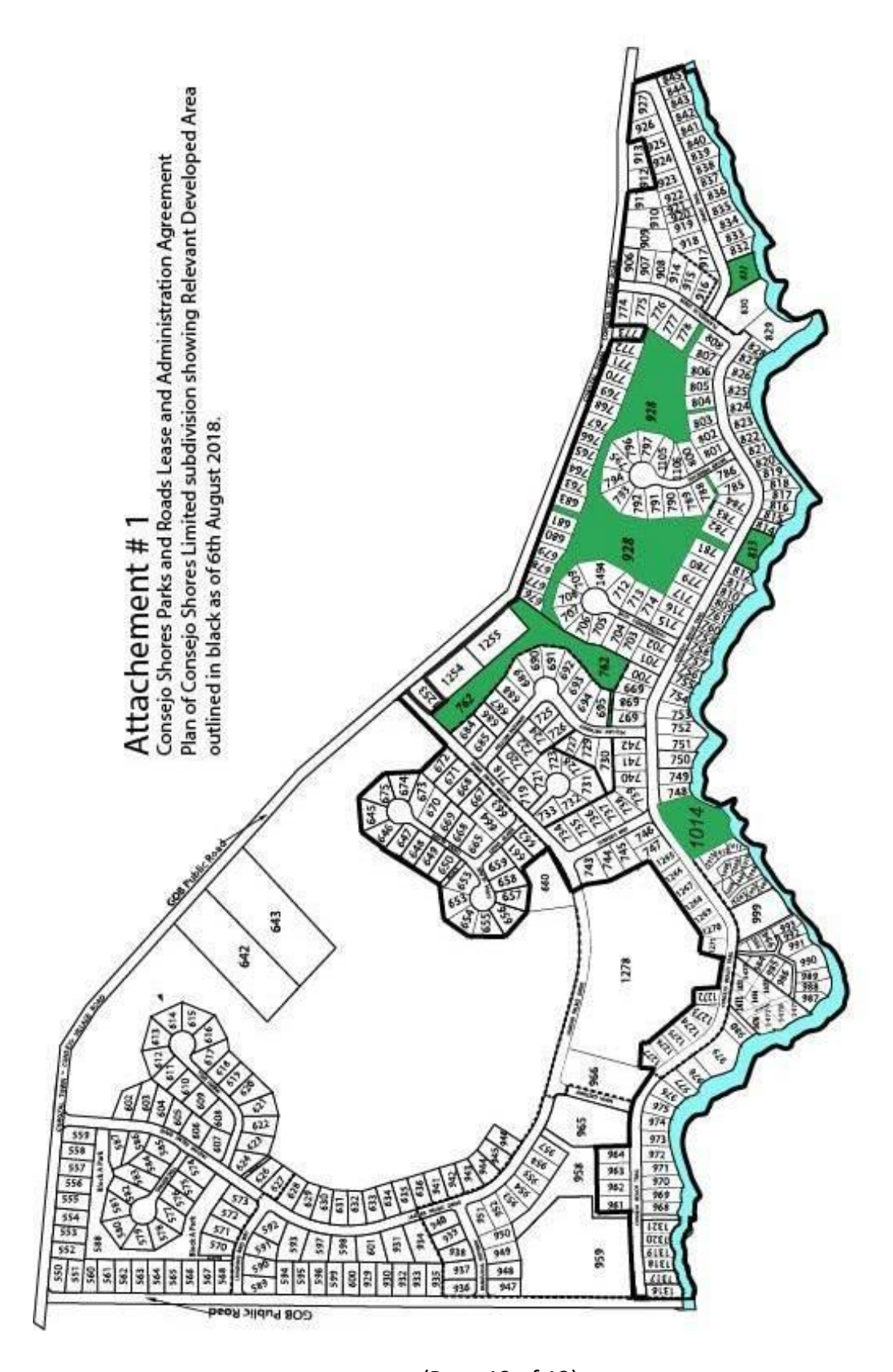
(Page 12 of 12)